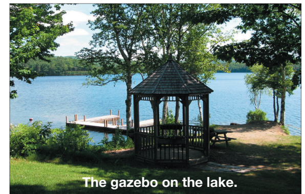
The gazebo on the lake.

Point your browser to knoxcountybeaverlodge.org , where you will find information on our recreational activities, camping, lodge rental, becoming a member, contact information, and a lot more.