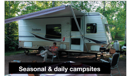
Seasonal & daily campsites