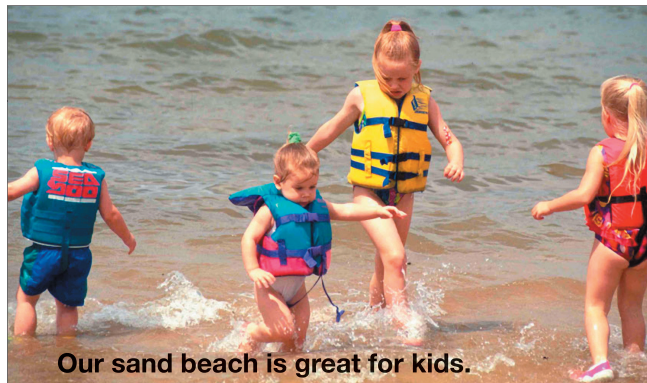
Our sand beach is great for kids.