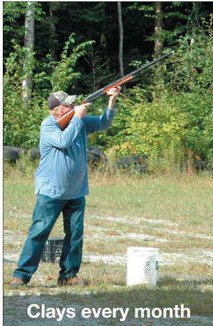
Clays every month