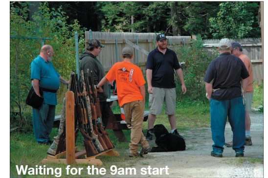
Waiting for the 9am start