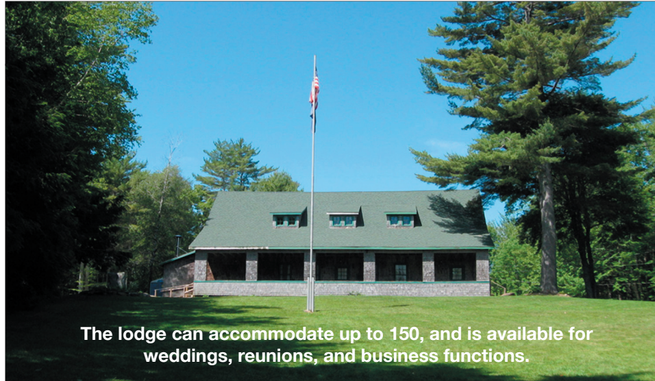
The lodge can accommodate up to 150, and is available for weddings, reunions, and business functions.